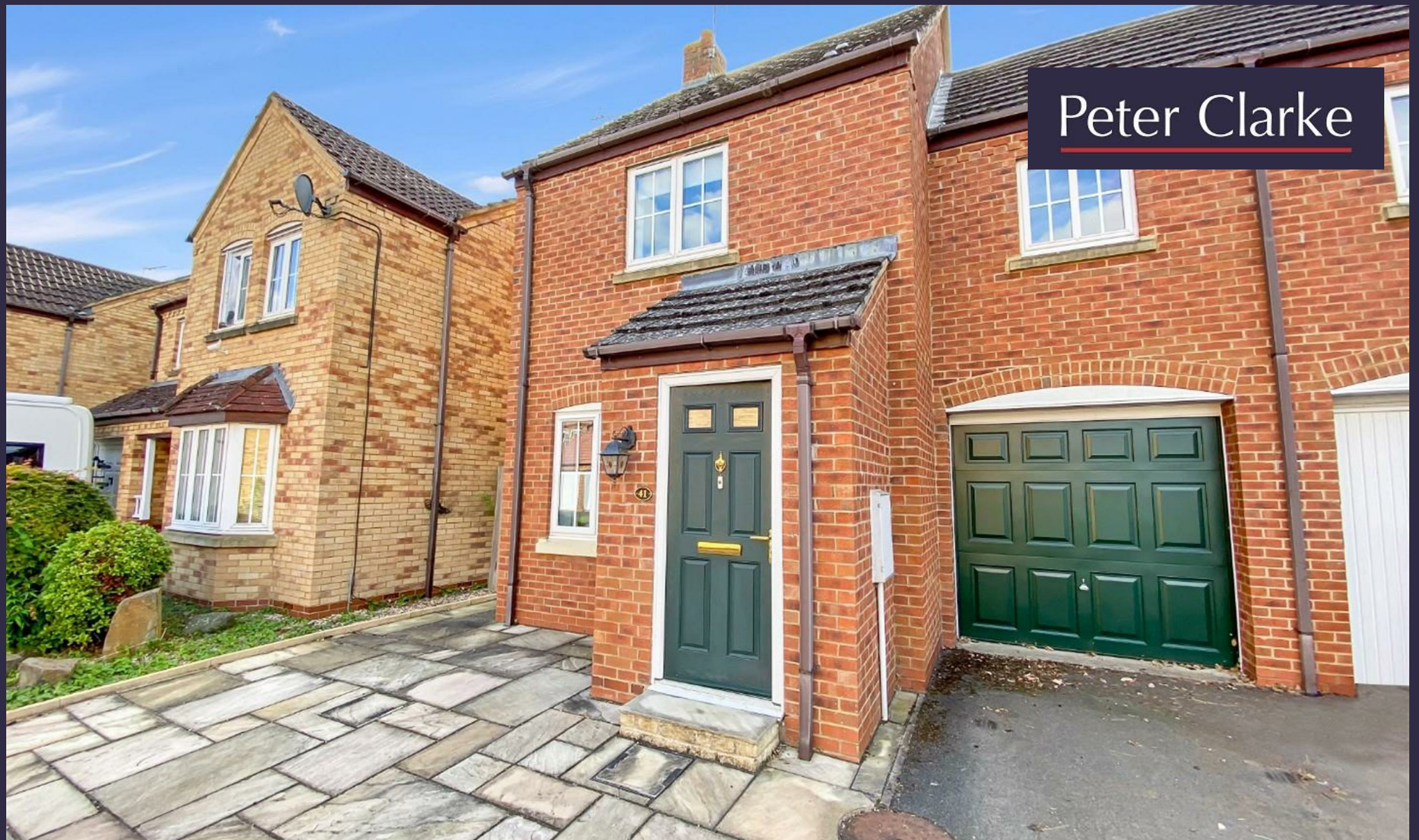
41 Millfield Close, Lower Quinton, Stratford-upon-Avon, CV37 8TF